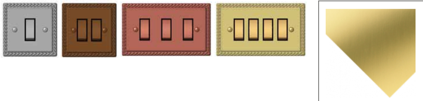
Specified in Polished Brass