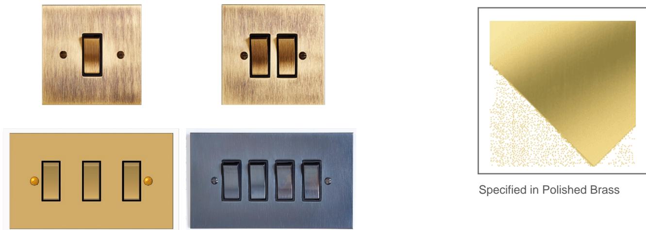
Specified in Polished Brass