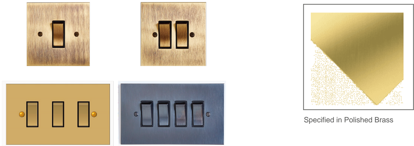
Specified in Polished Brass