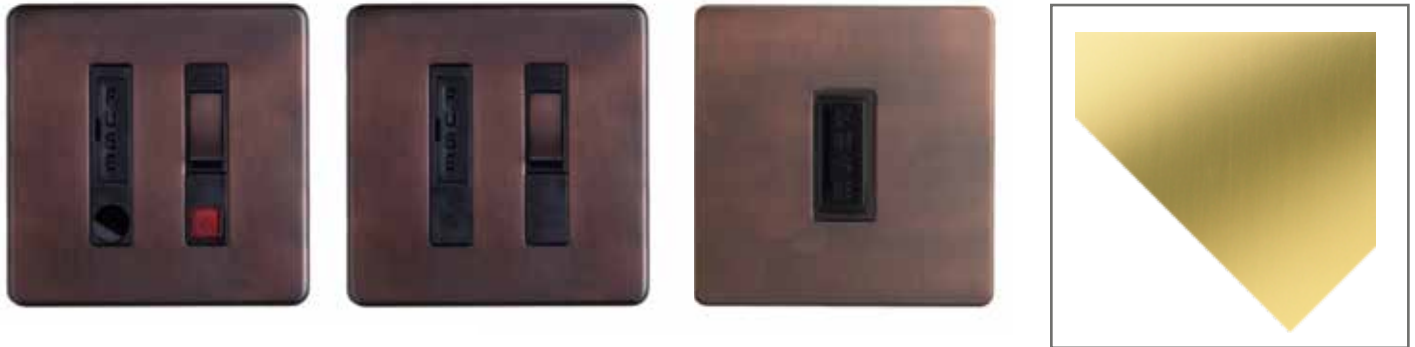
Specified in Polished Brass