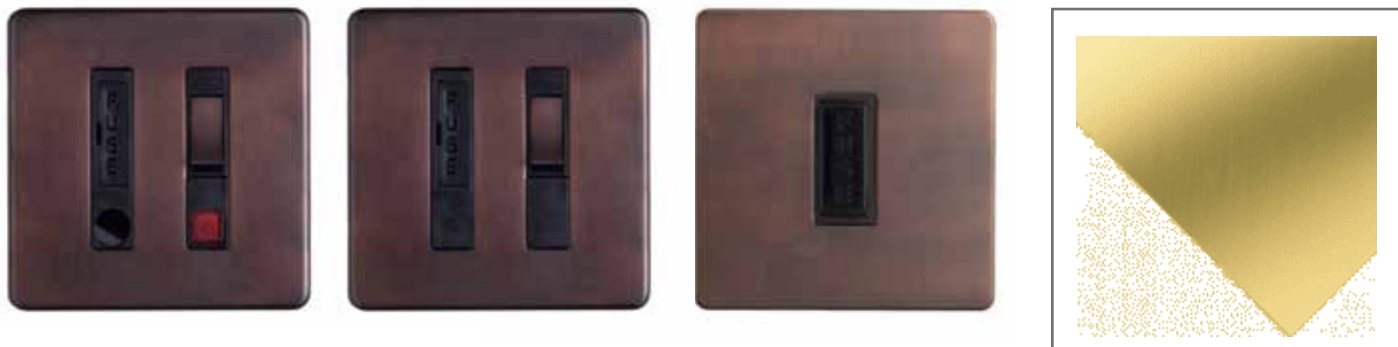
Specified in Polished Brass