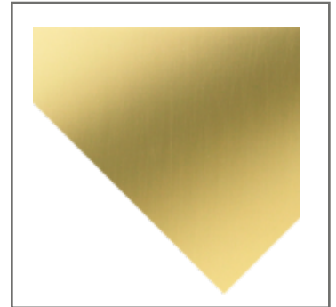
Specified in Polished Brass