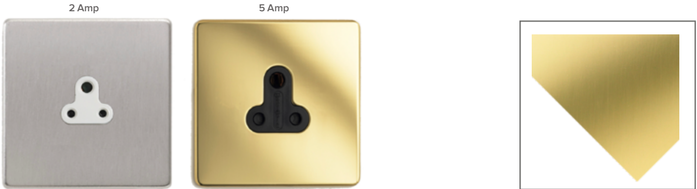
Specified in Polished Brass